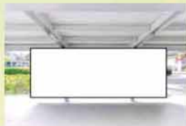
Horizontal Walkway billboards (15ft W x 10ft H) : Rs 30,000/-