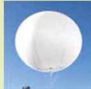
Sky Balloon (8ft x 8ft) : Rs.50,000/-