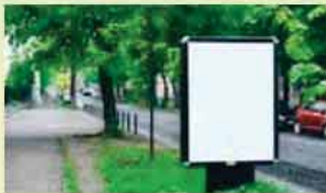
Pole boards (5ft x 3ft) :Rs30,000/- each