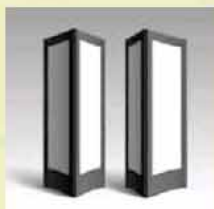
Pillar Rectangular Panels : Rs 80,000/- (set of 04)