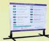
Rectangular Standee (5ft x 5ft) : Rs 30,000/-each