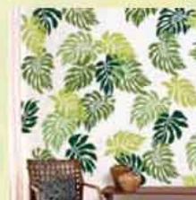
Selfie Point :Rs 50,000/-