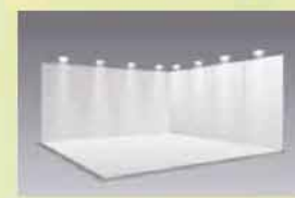
Panel Display (3ft x 8ft) : Rs 10,000/- each